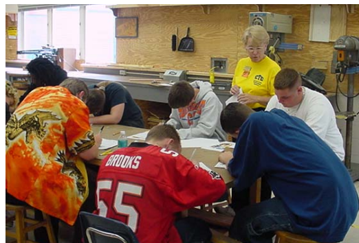
Students complete enrollment documents.