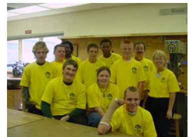
Students at Southeast High School

Thanks everyone at SHS and the Manatee County School District, ACT Education department.